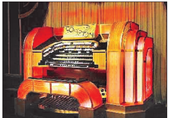
The Compton console

brought to this country from America in the 1930's. Unfortunately, cinema organs became redundant with the advent of talking pictures. We had a lively programme of popular tunes, many of which we were able to sing along to. In between medleys the organist gave us some very interesting information on organs in general, and his in particular. At the interval we went to the 1960's coffee bar to collect our cream teas. Again it seemed very authentic with a juke box, sixties style bar seats and