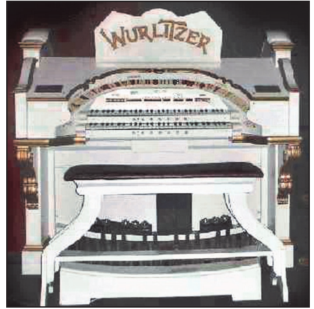
The Wurlitzer console

After a spot of lunch we headed off to Burtley Fen for our concert. It is held in a purpose built venue and the inside walls are covered with original posters of singers from a bygone age, shows etc. On the outside wall there are some giant organ pipes. The first half of the concert was played on a Wurlitzer organ, which had a chequered history, having been