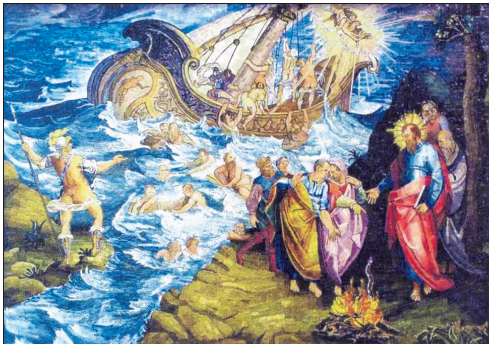
A mosaic about St Paul's rescue on Malta, inspired by a fresco in the Vatican by Nicolò Circignani and given to Malta by Pope Benedict XVI.