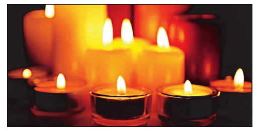
Compiled by Brenda

Worldwide Candle Lighting Day: light a candle to remember those loved ones who are no longer with us.